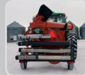
Compact Transport Configuration